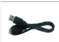
USB Cable USB 3.0