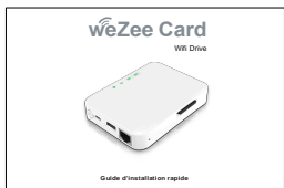
Quick Installation Guide